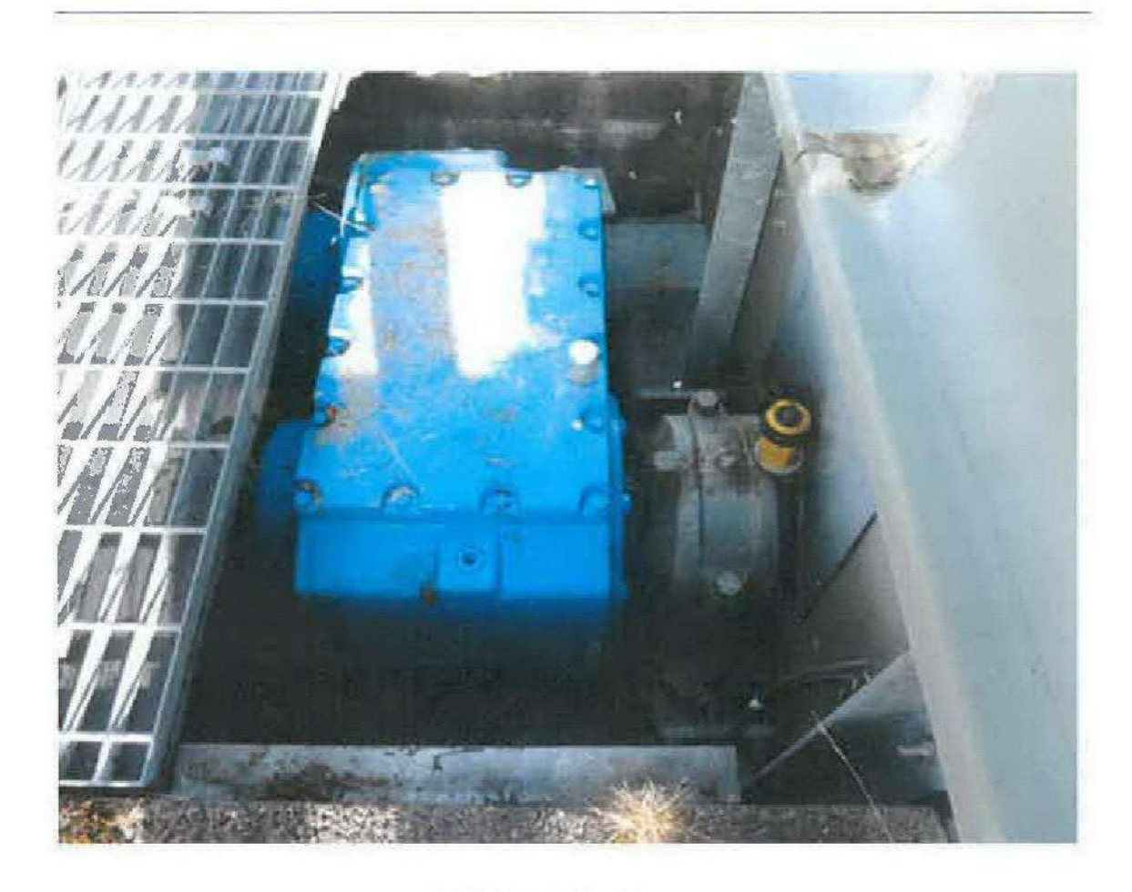
RBC Motor / Gearbox