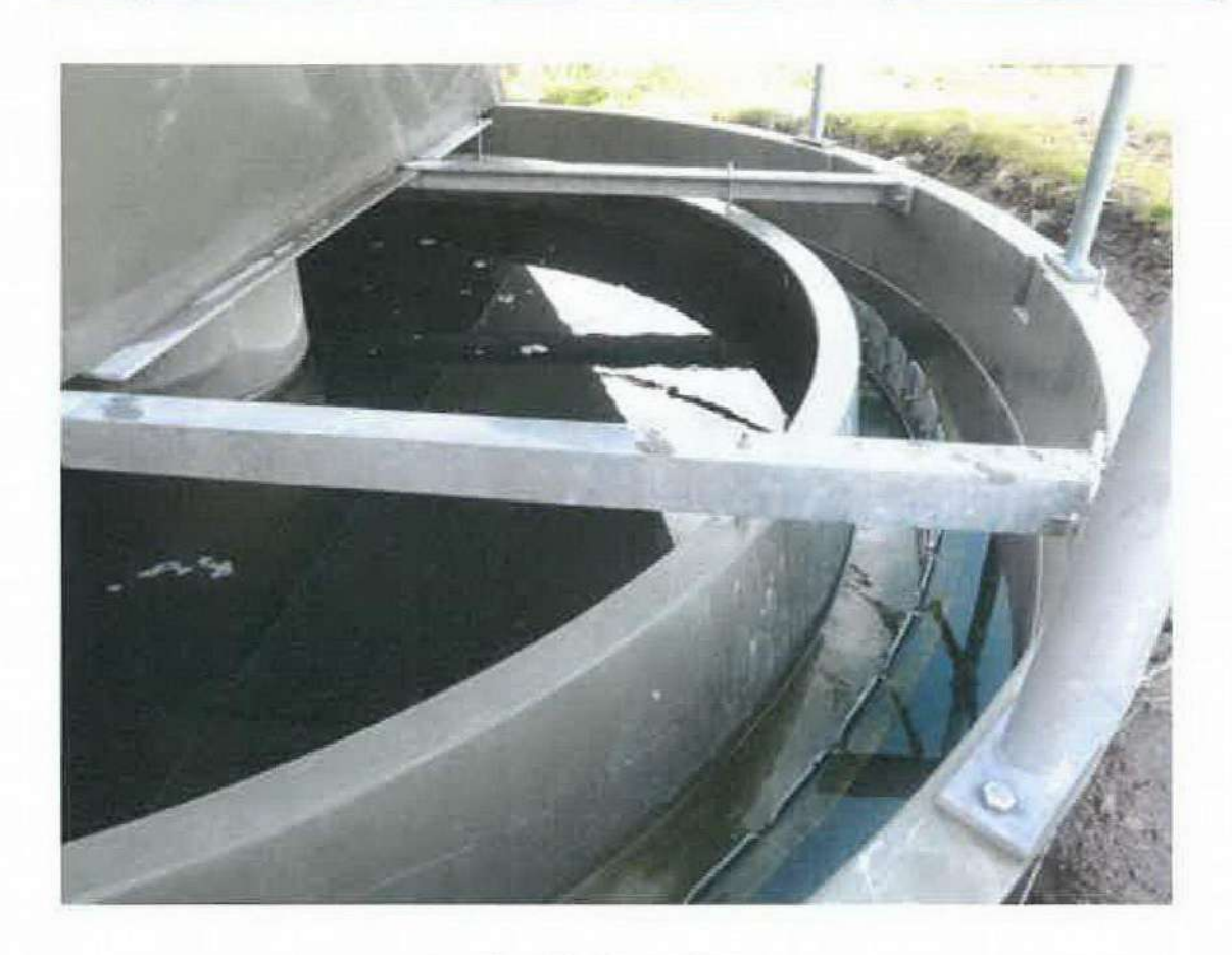
Final Settlement Tank