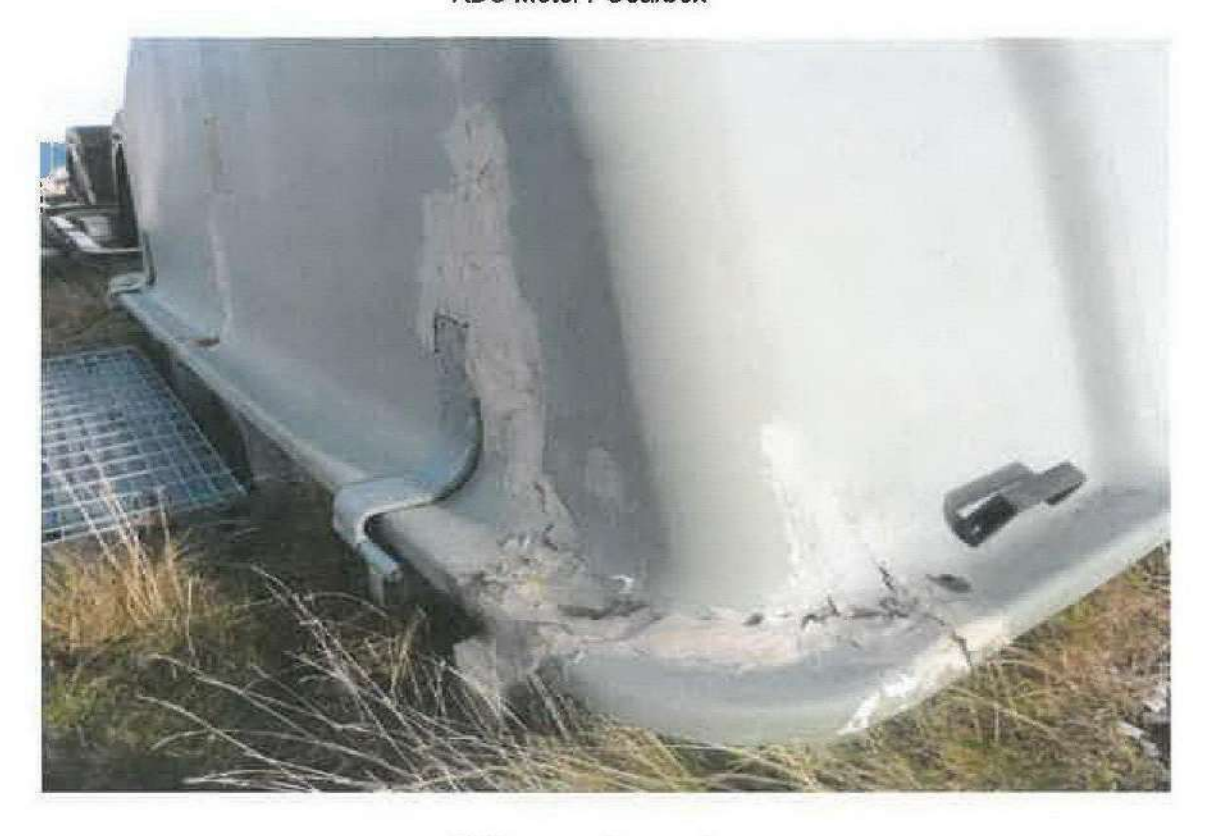
RBC corner damaged