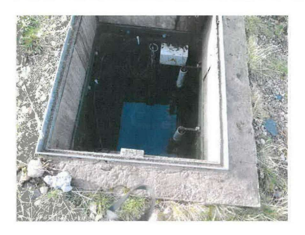
RAS Pump Chamber