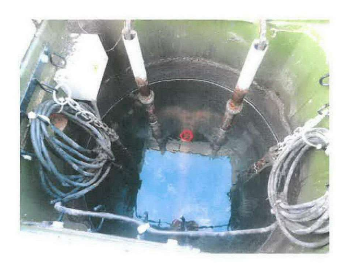
Balance Tank Pump Chamber