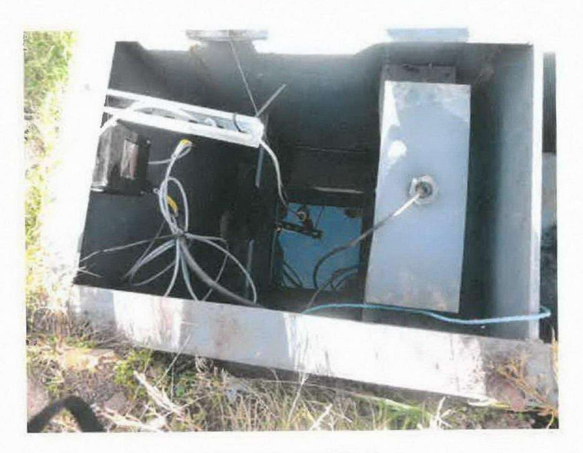
Final Effluent Settlement Chamber