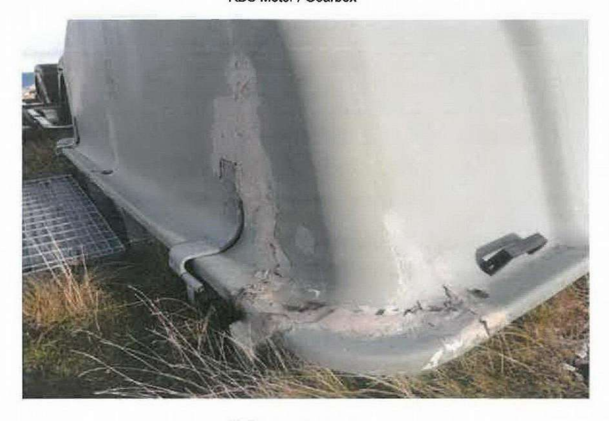
RBC corner damaged