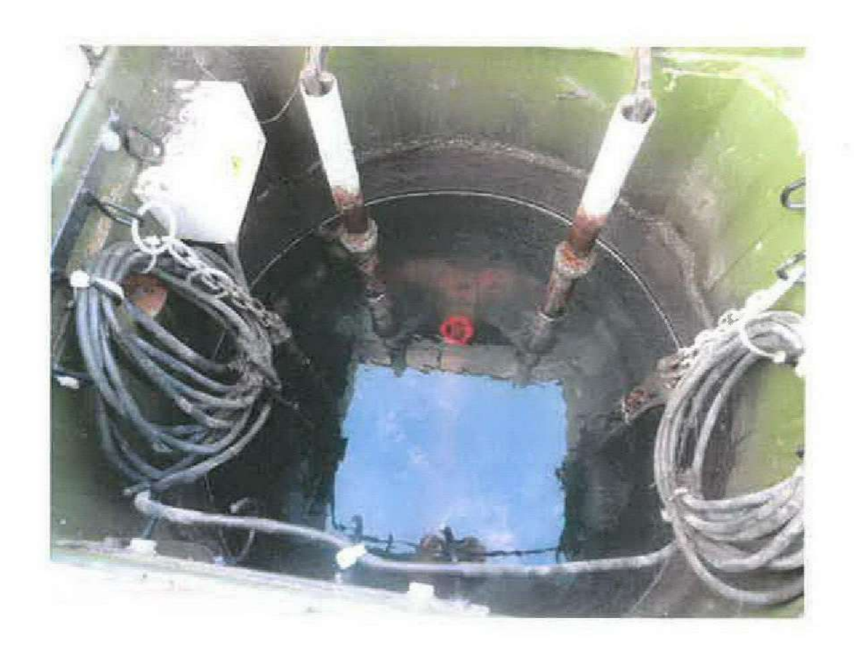
Balance Tank Pump Chamber