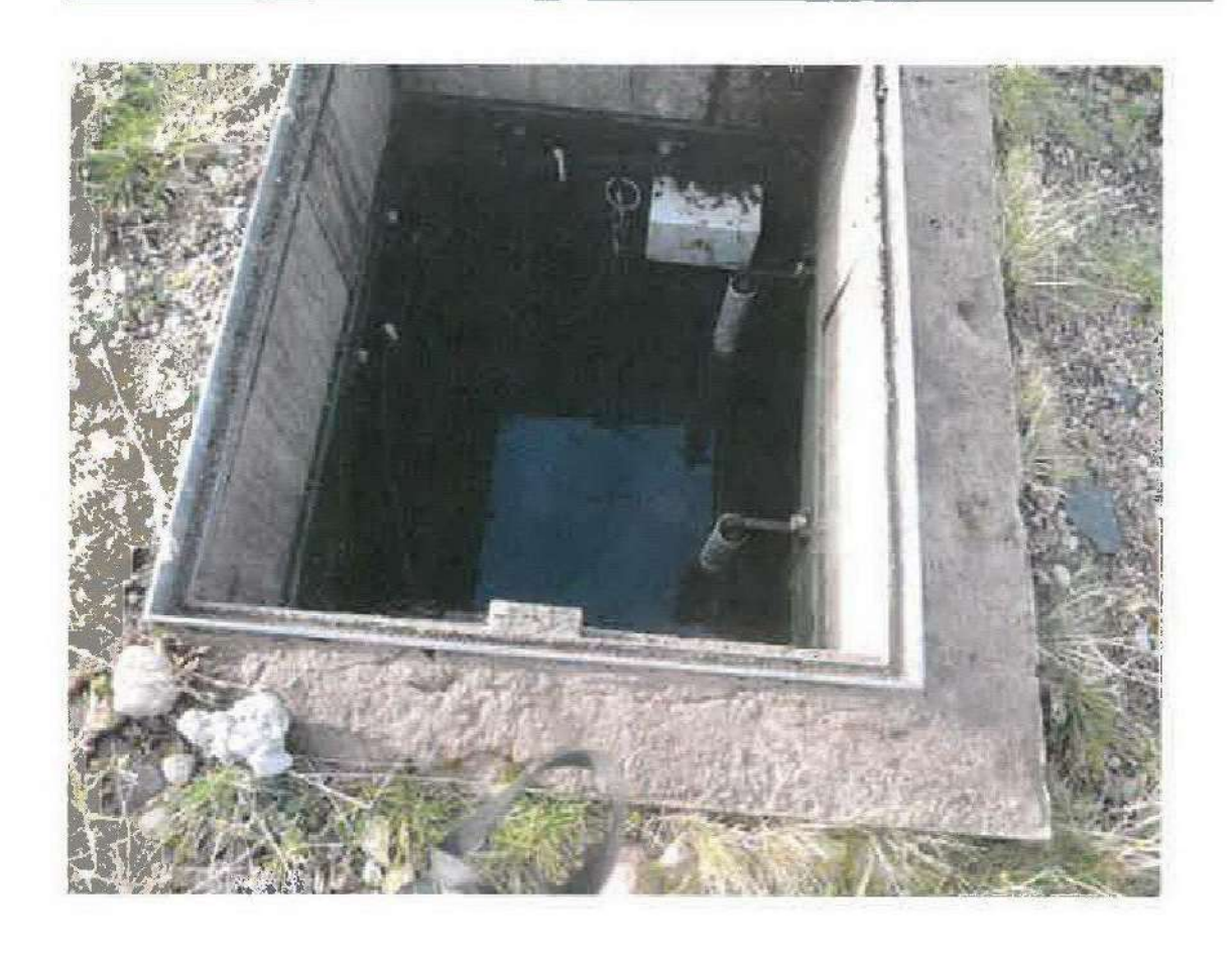
RAS Pump Chamber