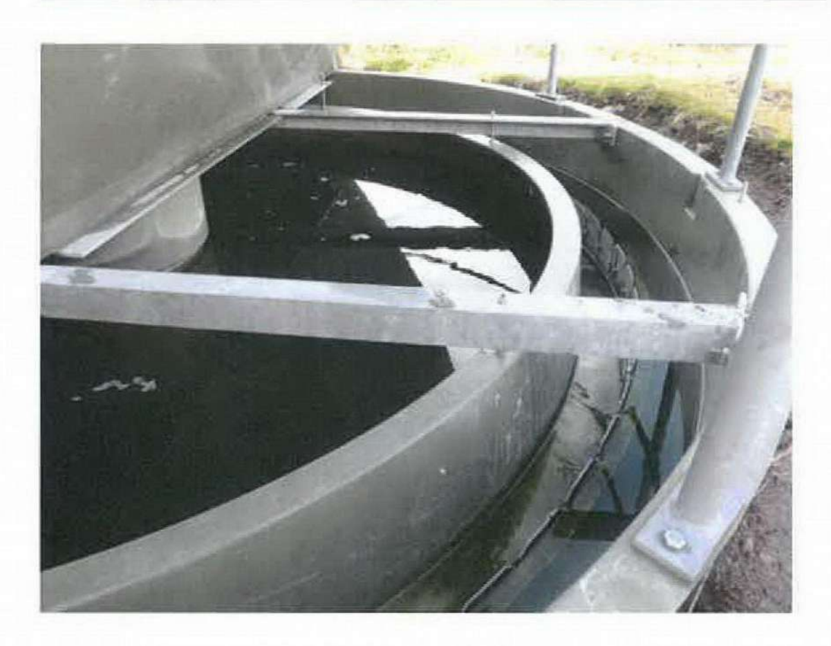
Final Settlement Tank