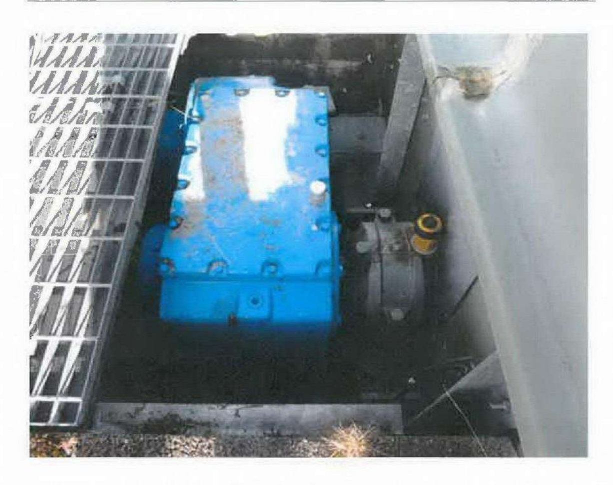
RBC Motor / Gearbox