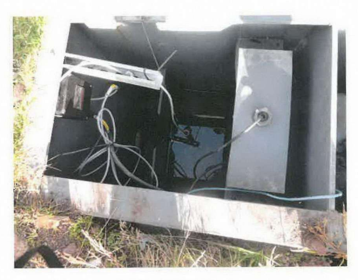
Final Effluent Settlement Chamber