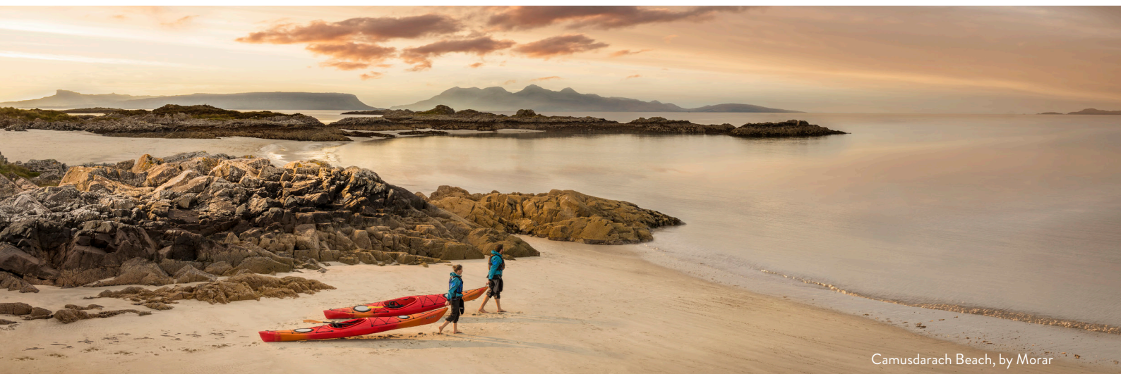
Camusdarach Beach, by Morar