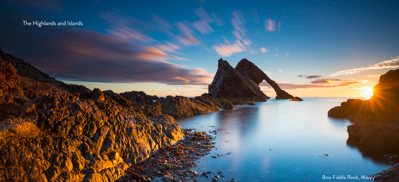
Bow Fiddle Rock, Moray